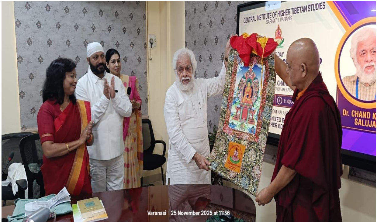
Varanasi | 25 November 2025 at 11:36