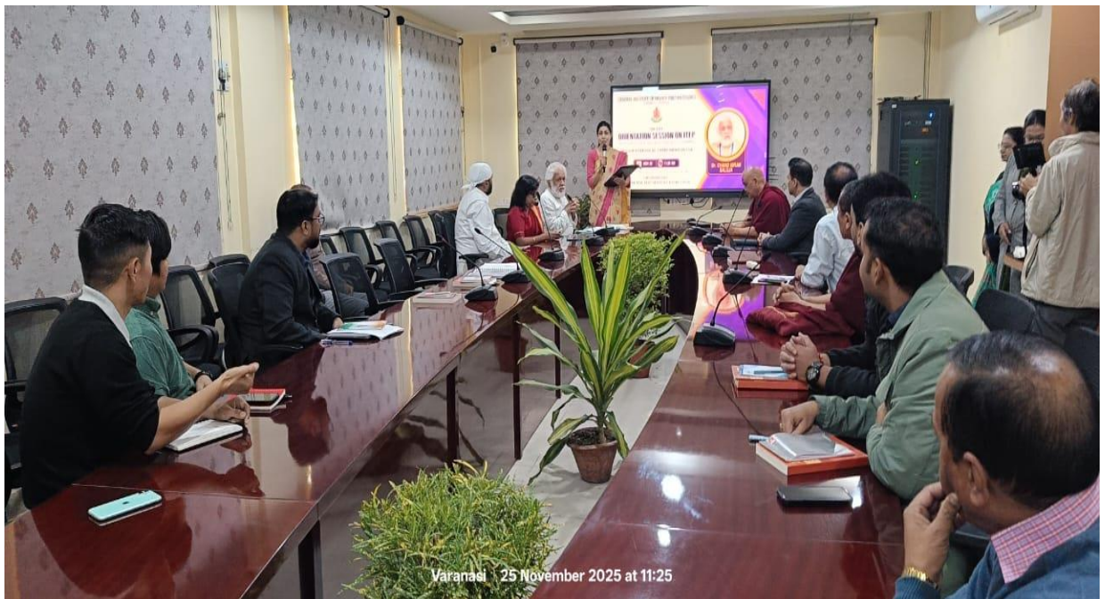
Varanasi | 25 November 2025 at 11:25