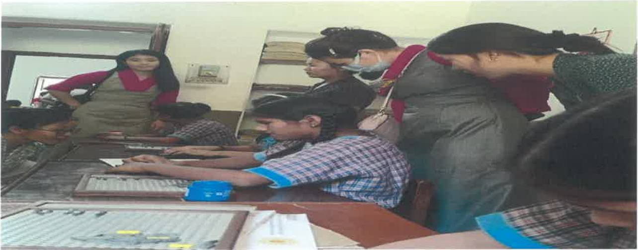
(Students of CTE, learning to read Braille at Jeevan Jyoti)