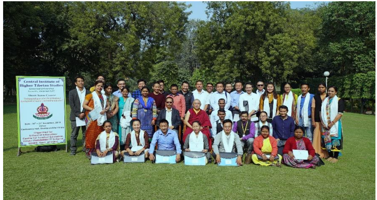
SoE/CTE, CIHTS under the PMMMNMTT Scheme, MHRD has organized this short term course

The event was basically designed to bring the secondary school teachers and university teachers on a single platform and share the information on teaching strategies needed for effective learning process. 38 teaching faculties participated in this short term course from various states of India.