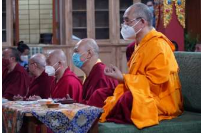
The entire family of the university expresses its gratitude and appreciates the generosity of authorities and the members of the Dakshinavan Bhikhuni Sangha Ashram, Taiwan. The merits of reading and studying Golden Kagyur earned and to be earned are dedicated to the Bhikuni Sangha members and all the sentient beings.