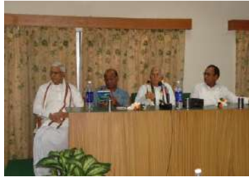
Sanskrit Kavi Sammelan