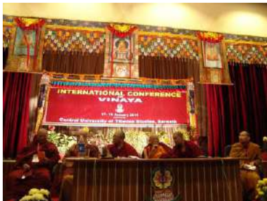
Gaden Tri Rinpoche heading a session of the Conference