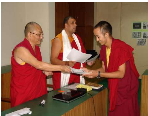
The Vice-Chancellor distributing certificates to students