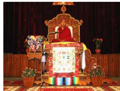
The Karmapa giving holy address to the university family