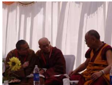
H. Holiness discussing with the participants