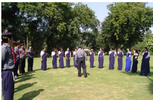
Scout and Guide Training

In the year, under report, the university ran such a B.Ed. course. This course which started on the 12 th of August, 2010, admitted 22 students. Trained teachers were appointed for teaching them and an upto-date syllabus was prepared. A Scout and Guide camp was organised for the all-round development of students. Competent teachers from Bharat Scouts and Guides were invited.