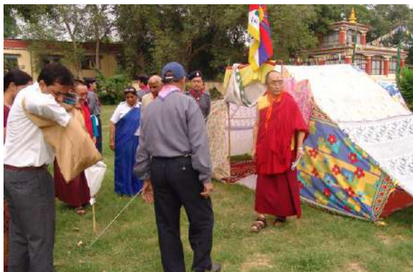
Vice-Chancellor in the Scout Guide Camp