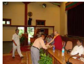
Vice-Chancellor Rewarding the Employees in the Rajbhasha Hindi Week