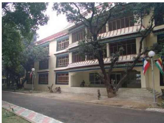
New Academic Sambhot Bhavan

The Prime Minister of the exile Tibetan Government, Dharamshala, Prof. Samdhong Rinpoche came to participate in the International Tengyur Translation Conference. He inaugurated the newly constructed Sambhot Bhavan on 12.01.2011. This academic building is laden with many facilities. Apart from classrooms, cabins have been built for teachers with all facilities, so that after classes, they can do their research and study. For this in every cabin, computer and internet facility are to be given. For special lectures, workshops and seminars, there are two seminar rooms, which are filled with multi-media facilities.