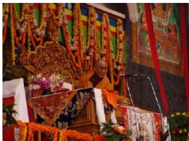
The Holiness delivering Pravachan