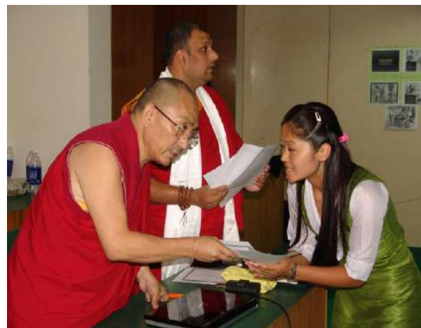
A girl participant receiving the training certificate