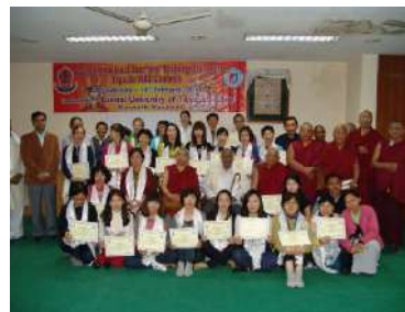
Group of Korean students and teachers