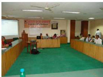
Rajbhasha Hindi Workshop

On 26.03.11, a one-day workshop was on "Sangh ki Rajbhasha niti" was organised where all employees of the University participated. Rajbhasha officers from different institutions were present on the occasion.