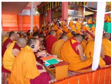
Monks community listening to the Pravachan