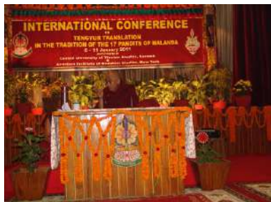
H.H. the Dalai Lamaji addressing the Conference