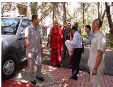
The Registrar welcoming H. Holiness the Karmapa

His Holiness the Karmapa Rinpoche arrived at the university on 21.03.2011 at forenoon 11 o'clock. Every year whenever the Karmapa arrives at Sarnath, he definitely comes to the university. This year also he came and addressed the students, teachers and employees of the university and gave his holy address.