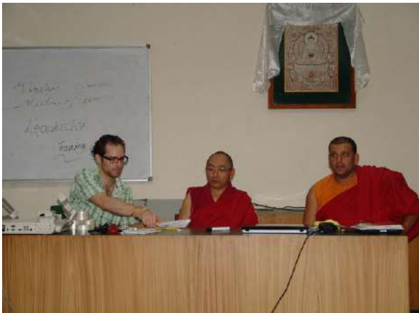
Inaugural session of the Workshop