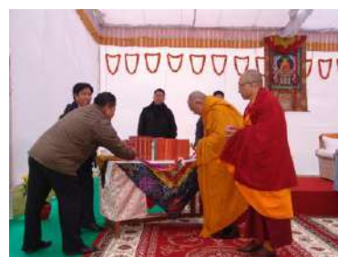
H. Holiness the Dalai Lama investgating the publication of books