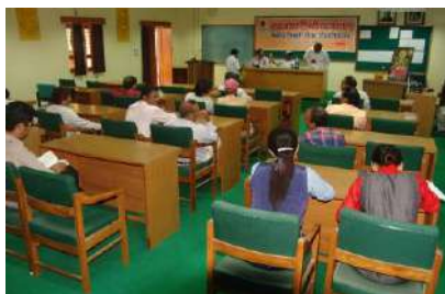
Session of the Workshop