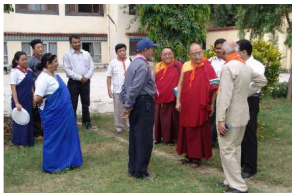
Vice-Chancellor Inspecting the Camp