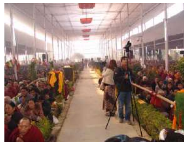
Devotees listening to the Pravachan