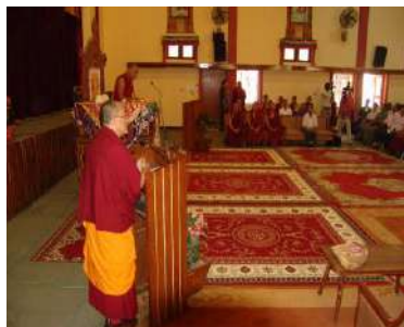
Welcome Address being given by the Vice-Chancellor