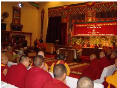
H. Holiness the Dalai Lama inaugurating the Vinaya Conference

For the first time in the university an international conference of monks of all living traditions was organised in which related issues of Vinaya like history of Vinaya, Upasampada, Apatti, Uposadh Vassavasa, Pravarana & Karmavastu etc. were widely discussed.