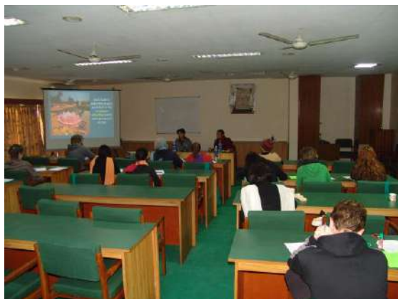
Professor of the university teaching Foreign Students

According to this programme, a lecture series by foreign teachers was arranged for students and teachers of the university on subjects like Western philosophy, computer science, social science, political science and environment etc. In the year under report, groups of students from five colleges of America including Hampshire college and from Tasmania University, Australia reached the University on 28 th December, 2010 and from 30 th December, 2010 to 20 January, 2011, they participated in the course organised by the university. During this period, from 12 th to 16 th January, 2011, they participated in the discourse of H.H. the Dalai Lama on Bodhicharyavatara and Bhavanakrama.