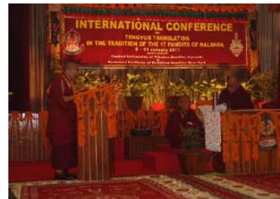
V.C. addressing the Conference