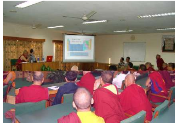
The Teachers and Students discussing on the lecture