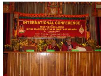
Prof. Robert Thurman chairing the session