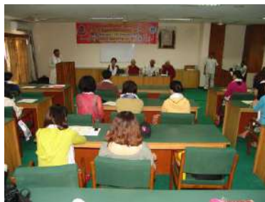
Inaugural session of the curriculum