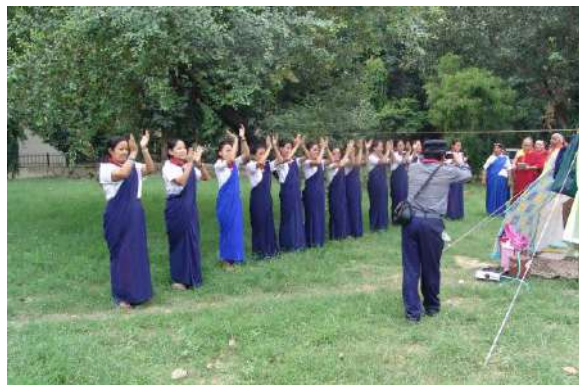
Participants in the Training Camp