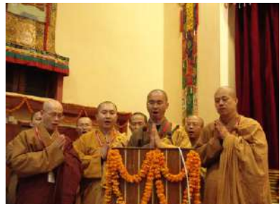
Taiwanese Monks performing Manglacharan