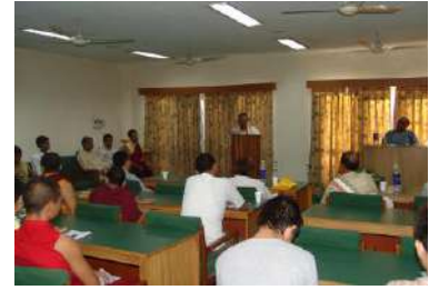
Poets presenting Kavita in the Kavi Sammelan