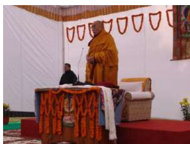
H. Holiness the Dalai Lama addressing the university family