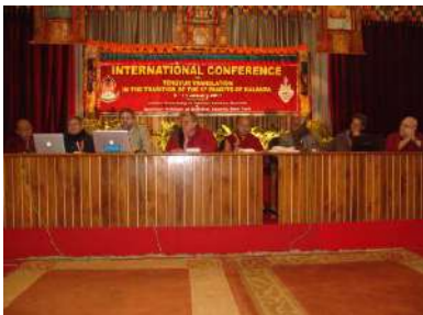
Inauguration session of the Conference

1. Multiple Language Translation, 2. Translation Standards, Criteria and Training/Curriculum, 3. Translation Terminology/Standardization, 4. Institution Building and coordinating.