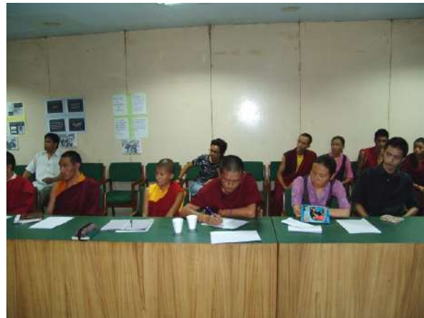
Participants receiving training