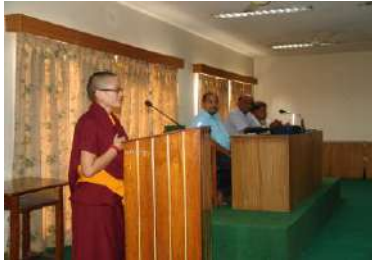
A Nun participating as a Sanskrit debate competition

On 29.09.2010, a Sanskrit Kavi Sammelan was also organised by the department, where poets from different universities and institutions participated.