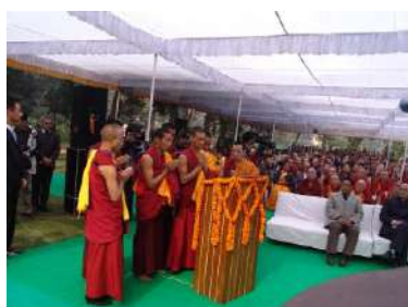
Monks students performing Manglacharan

His Holiness also blessed the students, teachers and employees in the open air campus of the university. On this occasion, he released 11 books published from the university's publication department. On this occasion, the delegates of the Tangyur conference, many distinguished scholars and citizens were present.