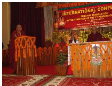
Prof. Samdhong Rinpoche expressing his views